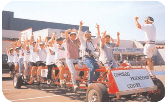
Society staff participate in Big Bike Ride to raise funds for the Heart & Stroke Foundation.