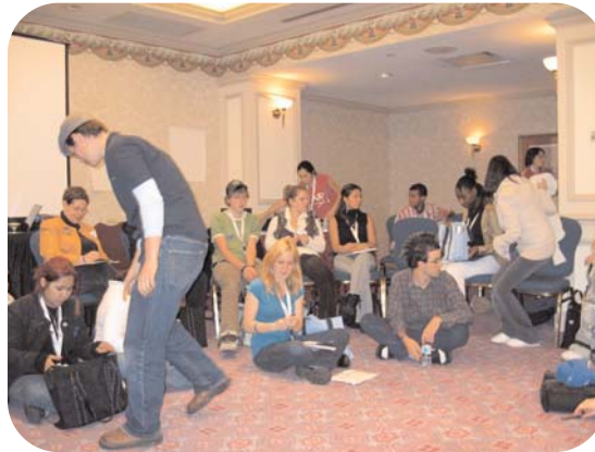
Youth share their perspective at the Youth Rights and Advocacy session

I thought the Youth Town Hall was especially effective because it included a very diverse range of youth. The people weren't just hearing one voice but many voices. So often adults say they're listening but they're not. During the Town Hall I could tell that the adults genuinely heard the youth voices. That was really important.